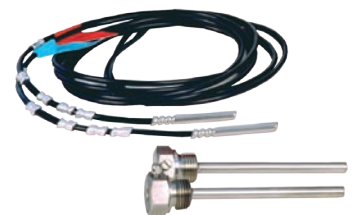
Temperature sensors and pockets

All sizes are approximate and are given for guidance only. Products and specifications may be subject to change from those shown without notice.