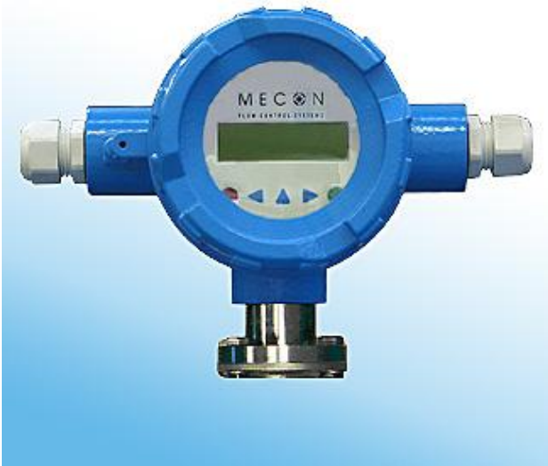
Fig 1 Magnetic inductive transmitter mag-flux M1