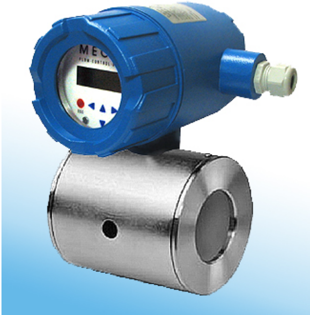
Fig 1 Electromagnetic flow sensor mag-flux SK with inductive transmitter mag-flux M1