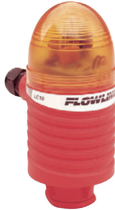
Strobe shown mounted on LC10 relay controller