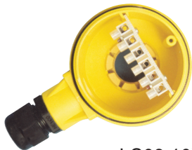
LC06-10X1 Junction Box

The alarm is commonly applied in tank spill prevention, pump or process protection applications. We recommend the use of secondary audible alarms in critical processes.