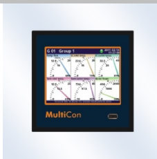
Multicon Touchscreen indicator with data logging and PID control