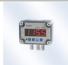
Wall mounted digital indicator, 20mm clearly visible digit height