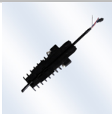
Cable support hanger