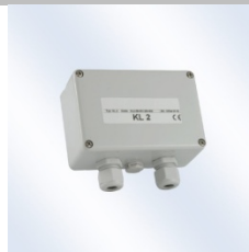
Cable Terminal Box with Vent