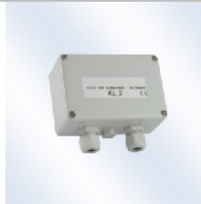
Cable Terminal Box with Vent