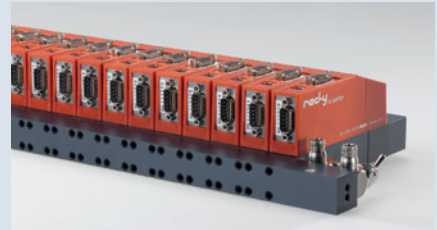
OEM version For customer-specific requirements