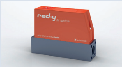
smart meter GSM Thermal mass flow meter