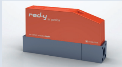
smart controller GSC Thermal mass flow controller